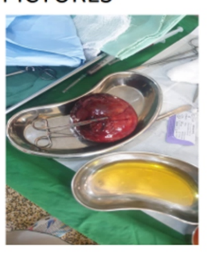
Figure 1: intraoperative picture showing the tumour (A); Resected specimen showing the tumour in a kidney dish (B)

The patient did not have any postoperative complications and was discharged on the 5th day post op. He was subsequently seen for follow-up with no complaint.