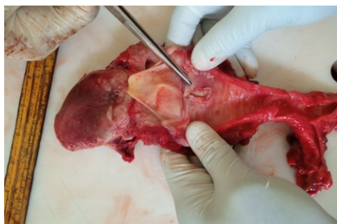
Figure 3: Deep laceration of the infraglottic area