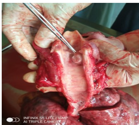
Figure 1: A drug foil lodged in the infraglottis region

the treatment of fever and headache 2 weeks prior to presentation was obtained. Radiological investigations were requested to help direct the next line of action. These were not done. On the second day on admission, he became restive and started destroying objects around him and hospital security guards were invited to restrain him. Immediately he was held, he slumped and died. A post mortem examination was performed and the following were the major findings: a drug plastic foil impacted in a lacerated mid portion of the larynx, laryngotracheobronchitis, bronchopneumonia with moderate edema, haemorrhagic gastritis and acute tubular necrosis of the kidneys. See figures 1-4. Petechial haemorrhages on the surface of internal organs were not seen. The cause of death was concluded as violent asphyxia (choking), due to drug plastic foil impaction.