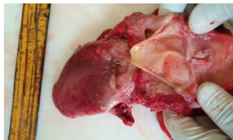
Figure 4: Deep laceration of the infraglottic area