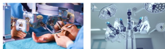
Figure 5: Robotic-assisted surgery

Robotics is a rapidly advancing field that involves the design, development, and application of robots. Robots are machines that can perform tasks autonomously or with minimal human intervention. 19 They are composed of various components that work together to enable their