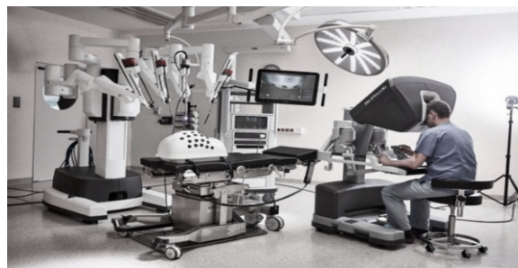
Figure 4: Da Vinci surgical system

i. Enhanced Surgical Procedures: One of the significant effects of robotics in medical operations is the improvement in surgical procedures. Robotic-assisted surgeries have become increasingly common, allowing for greater precision, accuracy, and control during complex procedures. The use of robotic systems, such as the da Vinci Surgical System, enables surgeons to perform minimally invasive surgeries with enhanced dexterity and visualization. This results in reduced trauma to patients, shorter hospital stays, and faster recovery times. Robotic surgical systems, such as the da Vinci Surgical System (see Figure 4),