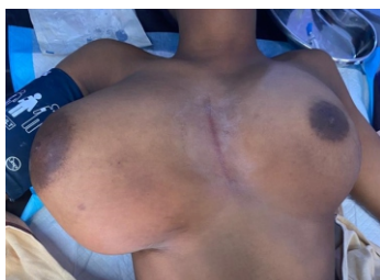
Figure 1: Photograph showing right breast enlargement

A full blood count, electrolyte and urea and an ultrasound scan was done. She subsequently underwent excisional biopsy under general anaesthesia with a histologic diagnosis of giant fibroadenoma.