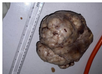
Figure 2: Photograph of the excised right breast lump