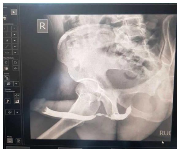
Figure 1: Long segment anterior urethral stricture on RUG

Statistical Analysis: The data analysis was done using statistical package for social sciences (SPSS) version 23 (SPSS Inc, IL, USA). At 95% confidence interval, P-value \leq 0.05 was considered statistically significant.