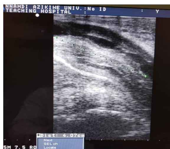
Figure 2: Sonogram showing long segment anterior urethral stricture