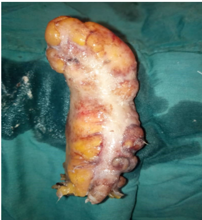
Fig 2: Excised appendix