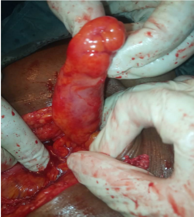
Fig 1: Inflamed appendix

time. 7 We report a case of concurrent acute appendicitis and infected ovarian cyst in a 49 year old P6+4A6 who presented with recurrent abdominal pain for 4 years duration.