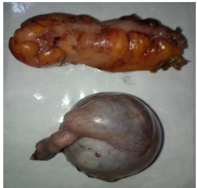
Fig 4: Excised appendix and ovarian cyst

The pathology reported revealed (1) Acute appendicitis with appendix measuring 7.5 x 0.7 cm with mucosal ulceration, transmural polymorph infiltrate often with serosal inflammatory response and fibrous adhesions. No fecolith found. (2) An ovarian cyst measuring 4.0 x 7.5 x 4.5 cm with thickened wall and abscess within it. No solid areas. The post operative period was uneventful and patient was kept on parenteral antibiotics, analgesics, intravenous fluid and monitoring of