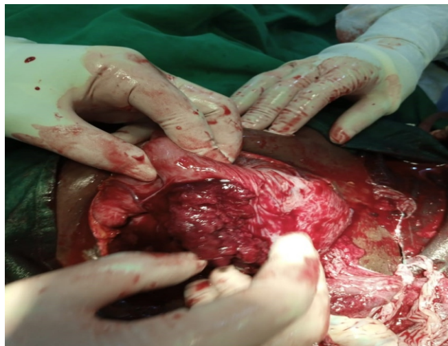
Figure 2. Placenta percreta with uterine rupture

5 minutes respectively. Baby was resuscitated and did well. Thereafter she was transfused with 4 pints of blood and maintained an uneventful postoperative recovery. Mother and baby were discharged after 6 days of admission. Hysterectomy was not done in this case because the placenta was carefully separated from the uterus and the small intestine. There was no need for intestinal resection and anastomosis since the attachment was only on the serosa of the small bowel.