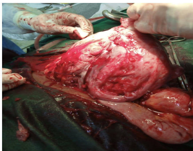
Figure 3. Repaired uterus